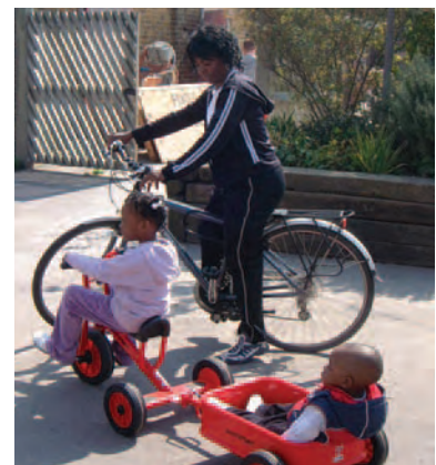
Photographs taken at 1st Place