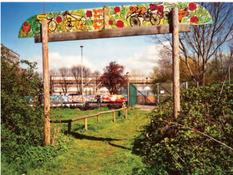
An entrance gate at the Burgess Park Bike Track